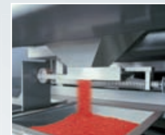
Automatic Bin Gate