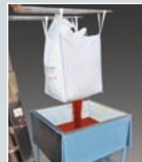
Quick and Easy to Fill

INTERSTAR Pigments, Admixtures & Fibers GranastAR Color Dispenser